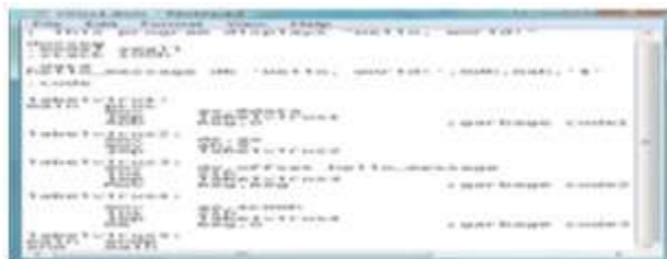
Figure 1: Assembly code of Virus File

The mutating behaviour of metamorphic viruses is due to their adoption of code obfuscation techniques like dead code insertion, Variable Renaming, Break and join transformation. Figure 1 shows the assembly file of the virus code. Computer viruses like polymorphic viruses and metamorphic viruses use more efficient techniques for their evolution so it is required to use strong models for understanding their evolution and then apply detection followed by the process of removal. Code Emulation is one of the strongest ways to analyze computer viruses but the anti-emulation activities made by virus designers are also active [4][5] [6].